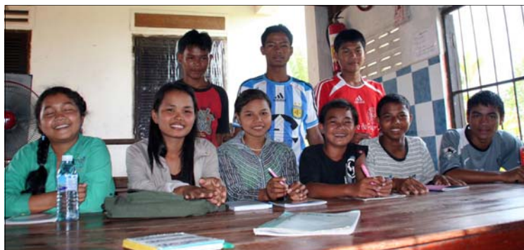
Students at the Sangkheum Centre for Children, Siem Reap, Cambodia